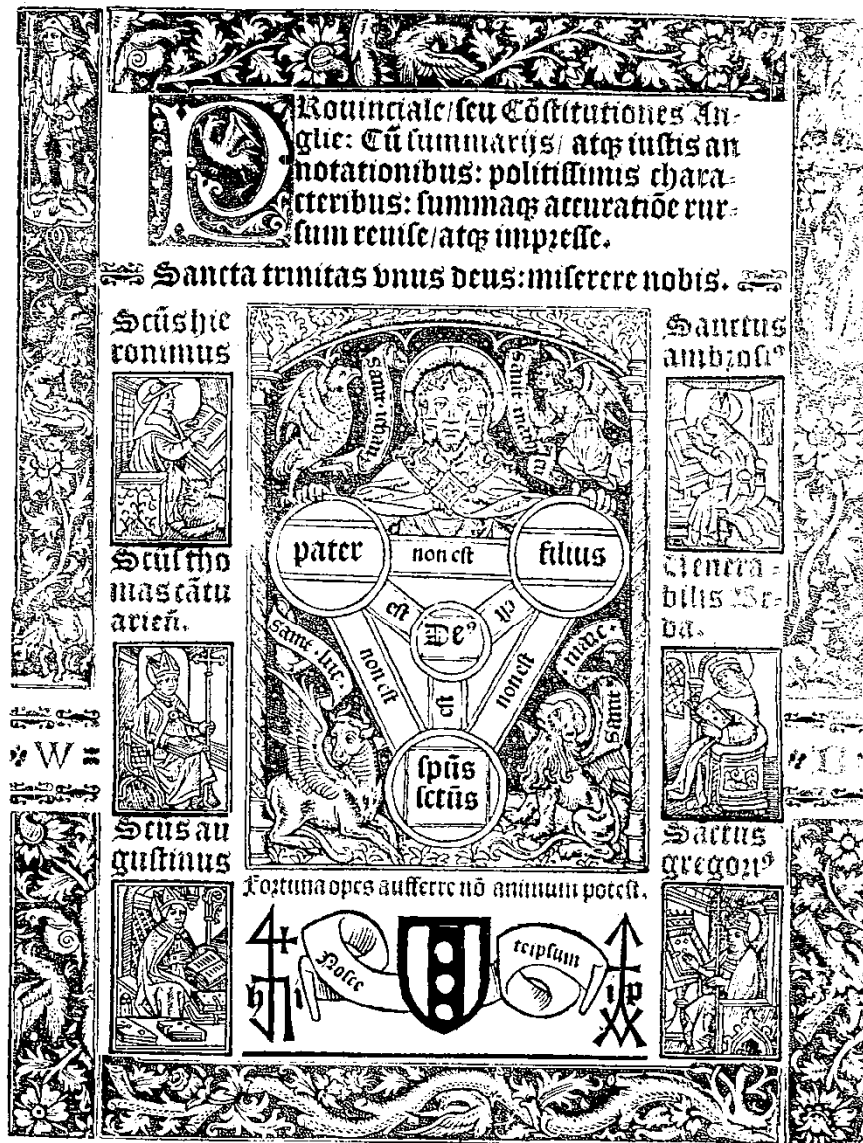
Provinciale seu constitutiones angliae This image is from the 1505 Paris edition, A1 r .